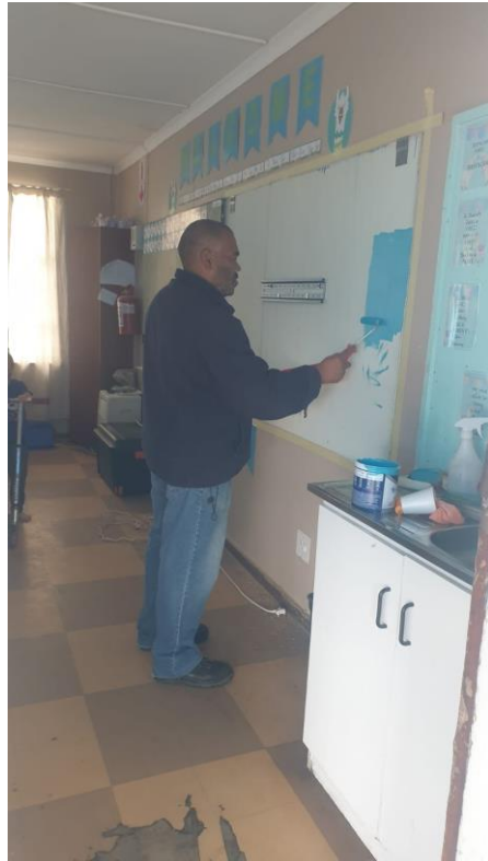
Preparing of spaces: